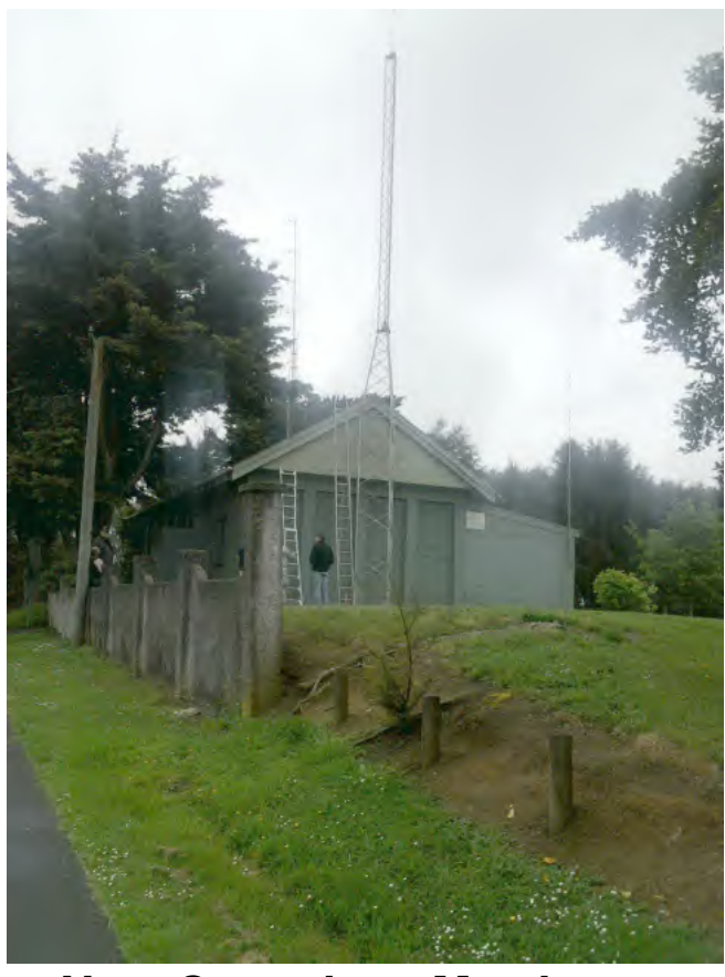
Next Committee Meetings - 2nd November & 7th December

Bridge to Bridge is next month....names to Section Leader ASAP please.