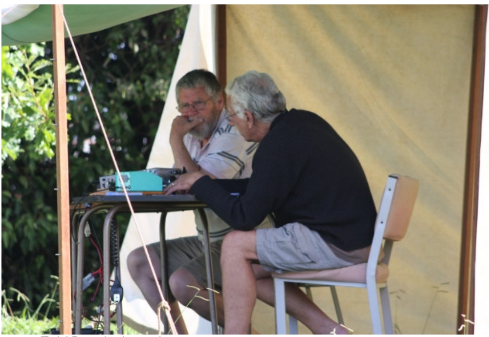
2010 Field Days in the park.